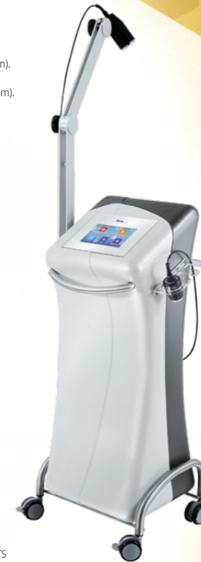
WATERPROOF APPLICATORS FOR UNDERWATER TREATMENTS