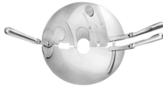
ASI210508 PERCY AMPUTATION RETRACTOR REVERSIBLE-HANDLE