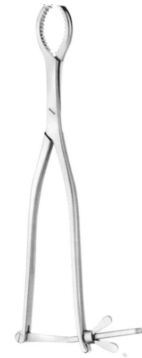
ASI190821 HEY-GROVES BONE HOLDING FORCEPS 8.5MM 30.5 CM