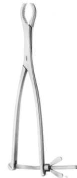
ASI190820 HEY-GROVES BONE HOLDING FORCEPS 8.5MM 30.5 CM