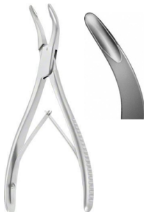
ASI190550 BANE-HARTMAN BONE RONGEUR CURVED 175 MM