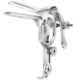
ASI240103 GRAVE VAGINAL SPECULUM 95X30MM