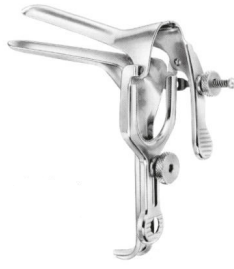
ASI240102 GRAVE VAGINAL SPECULUM 75X20MM