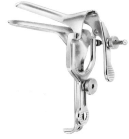
ASI240104 GRAVE VAGINAL SPECULUM 105X33MM