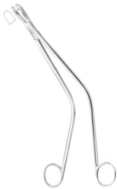
ASI240286 SCHUBERT BIOPSY FORCEPS 260MM