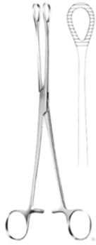
ASI140124 FOERSTER SPONGE FCPS SERR STR 242MM