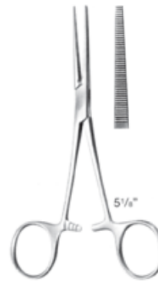
ASI130197 PEAN FORCEPS DEL STR 140MM