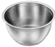
ASI280120 LABORATORY DISH 0.4 L