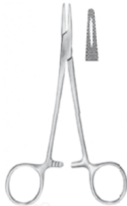
ASI170135 MAYO-HEGAR NEEDLE HOLDER 150MM