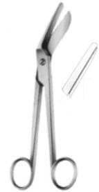
ASI110321 BRAUN-STADLER EPISIOTOMY SCISSORS 145MM