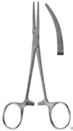
ASI130178 CRILE FORCEPS CVD 140MM