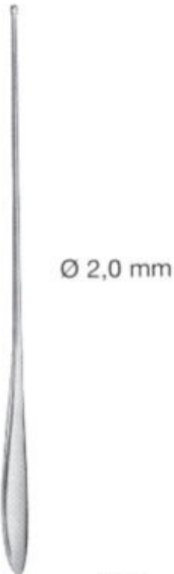
ASI160128 MYRTLE LEAF PROBE 2MM 16CM