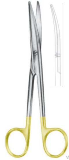
ASI110445 TC MAYO-LEXER SCISSORS CVD 165MM