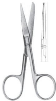
ASI110112 SURGICAL SCISSORS STR S/B 145MM