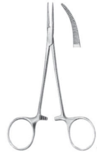
ASI130144 HALSTED-MOSQUITO FORCEPS DEL CVD 125MM