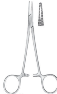
ASI170134 MAYO-HEGAR NEEDLE HOLDER 14CM