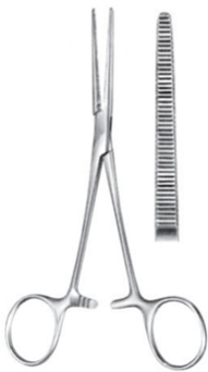
ASI130217 ROCHESTER-PEAN FORCEPS STR 160MM