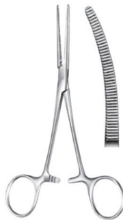
ASI130225 ROCHESTER-PEAN FORCEPS CVD 160MM