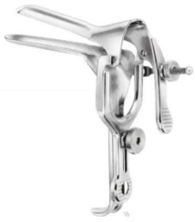
ASI240102 GRAVE VAGINAL SPECULUM 75X20MM