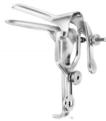
ASI240104 GRAVE VAGINAL SPECULUM 105X33MM